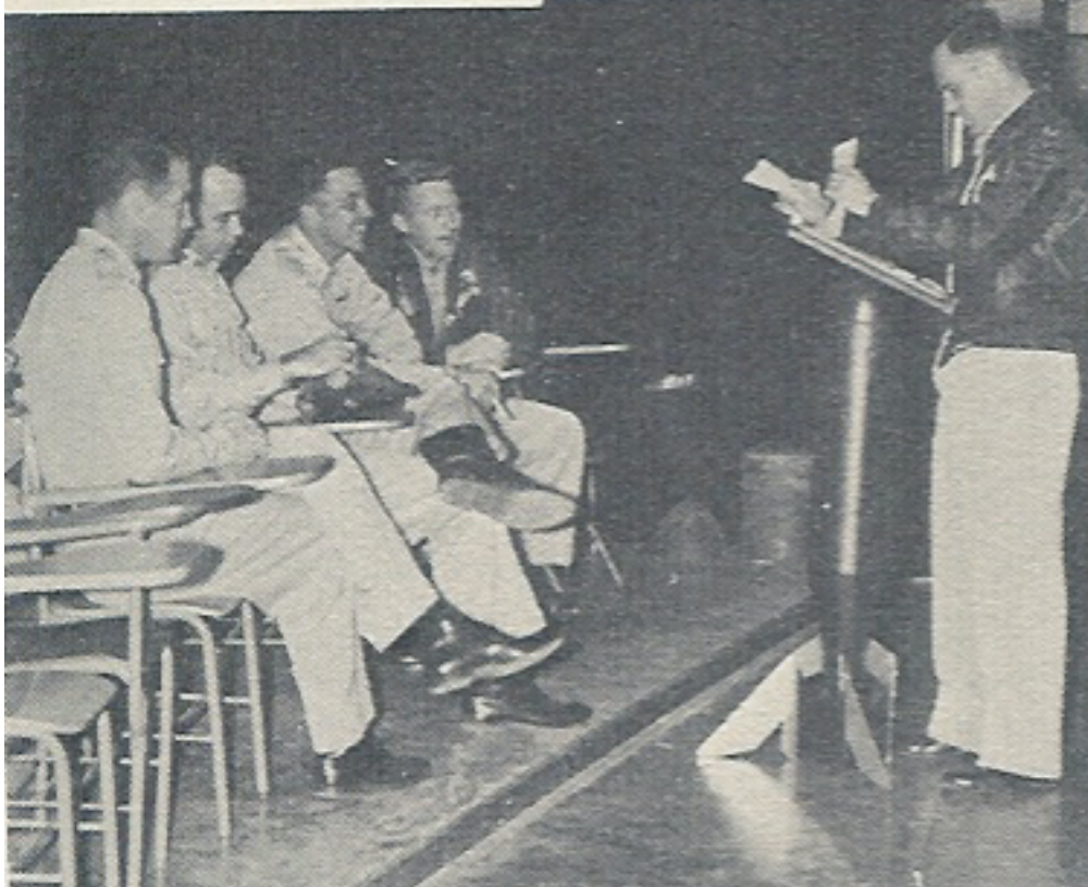
Preflight briefing, England AFB, LA, 1955