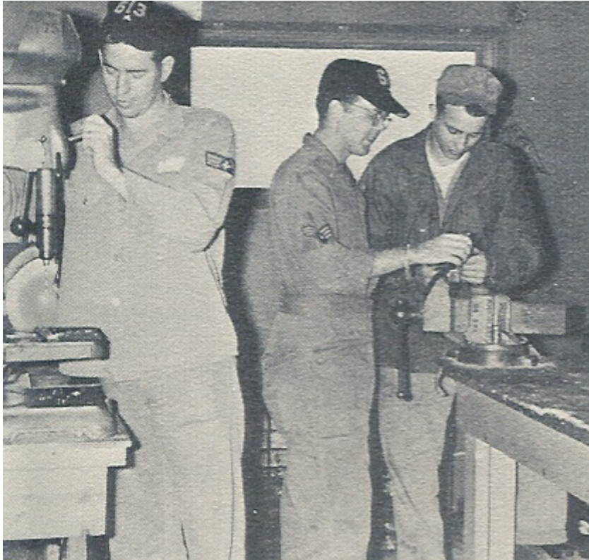
Sheet metal shop, England AFB, LA, 1955