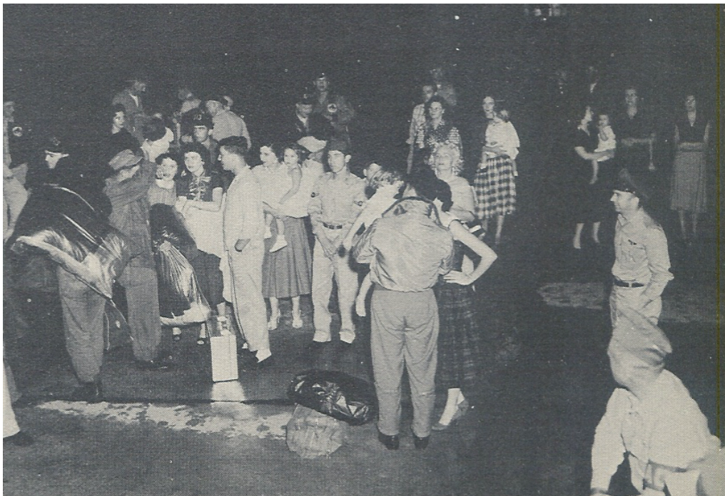
Friends and families welcome the 613 FBS on their return from France where they spent six months on a TDY mission, England AFB, LA, 1955