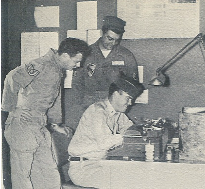
Studying work requests in the Electronics Office